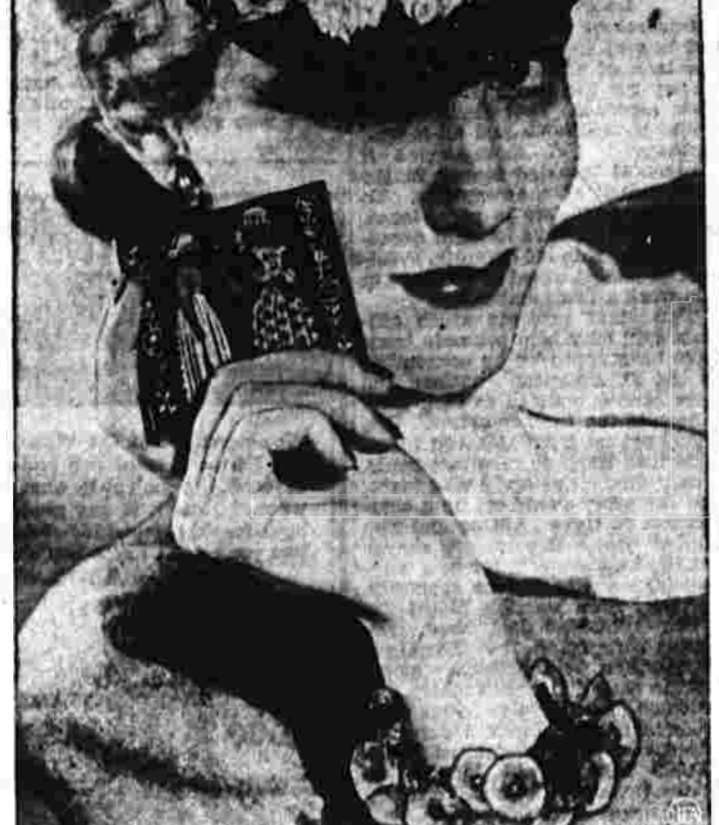
THIS utterly feminine hat of navy straw with pink blossoms and pink veiling looks like a prize example of the confectioner's art.