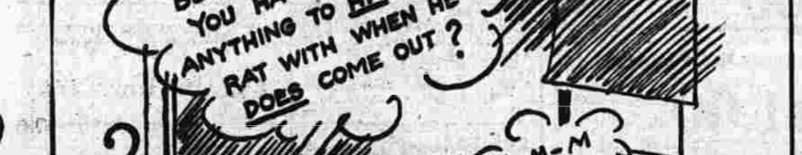
Look out for Mitches in your contract... Apply—and if I take the job, an I get a raise of salary every year?