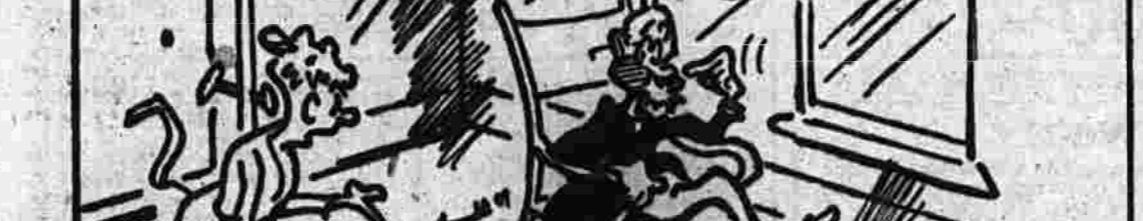
"To be frank, boss, we're tired of comedy parts—we feel we could do something really serious in the theater!"