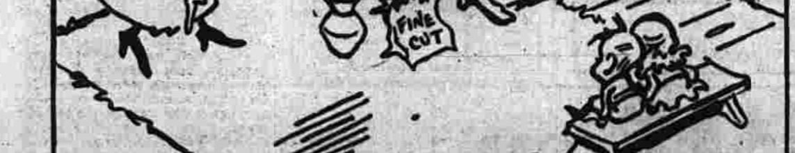
Look out for Mitches in your contract... Apply—and if I take the job, an I get a raise of salary every year?