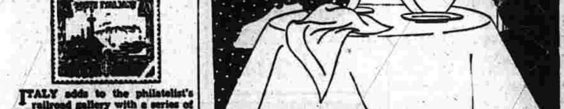
Look out for Mitches in your contract... Apply—and if I take the job, an I get a raise of salary every year?