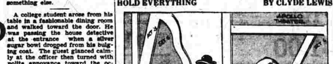
TO BE frank, boss, we're tired of comedy parts—we feel we could do something really serious in the theater!