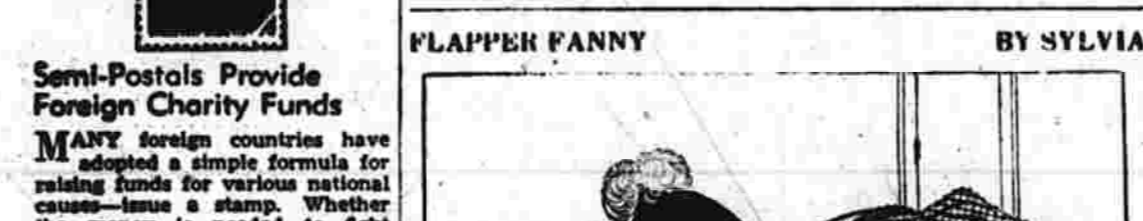
Look out for Mitches in your contract... Apply—and if I take the job, an I get a raise of salary every year?