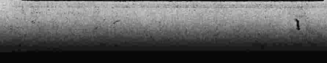
"To be frank, boss, we're tired of comedy parts—we feel we could do something really serious in the theater!"