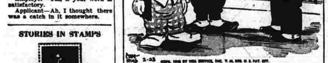
"To be frank, boss, we're tired of comedy parts—we feel we could do something really serious in the theater!"