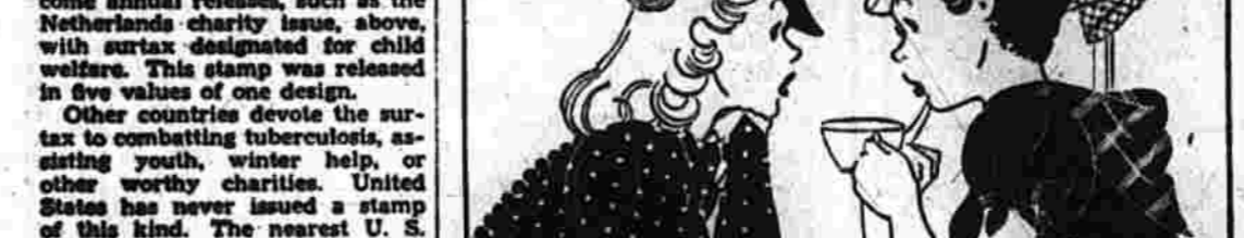
"To be frank, boss, we're tired of comedy parts—we feel we could do something really serious in the theater!"