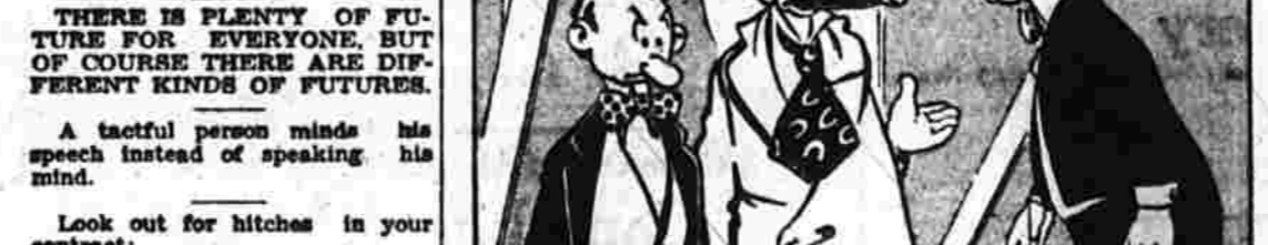
Look out for Mitches in your contract... Apply—and if I take the job, an I get a raise of salary every year?